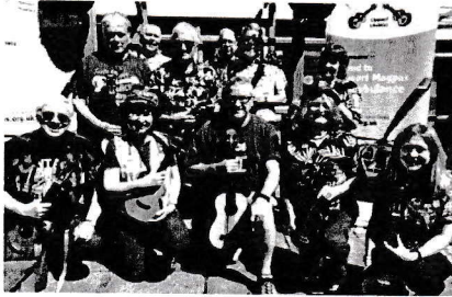
proudly supporting Magpas - All Air Ambulance

Appearing at St Mary Magdalene Church Stilton